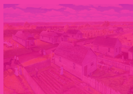
A drawing from the Davis Bottom History Preservation Project.

The award was presented at the 83rd Annual SAA meeting in Washington, D.C., on Friday, April 13.