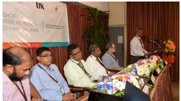
Scholars at the Workshop on Innovative Religiosity, July 2017