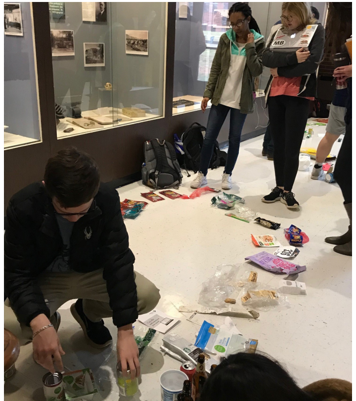
ANT 101 students participating in garbage analysis